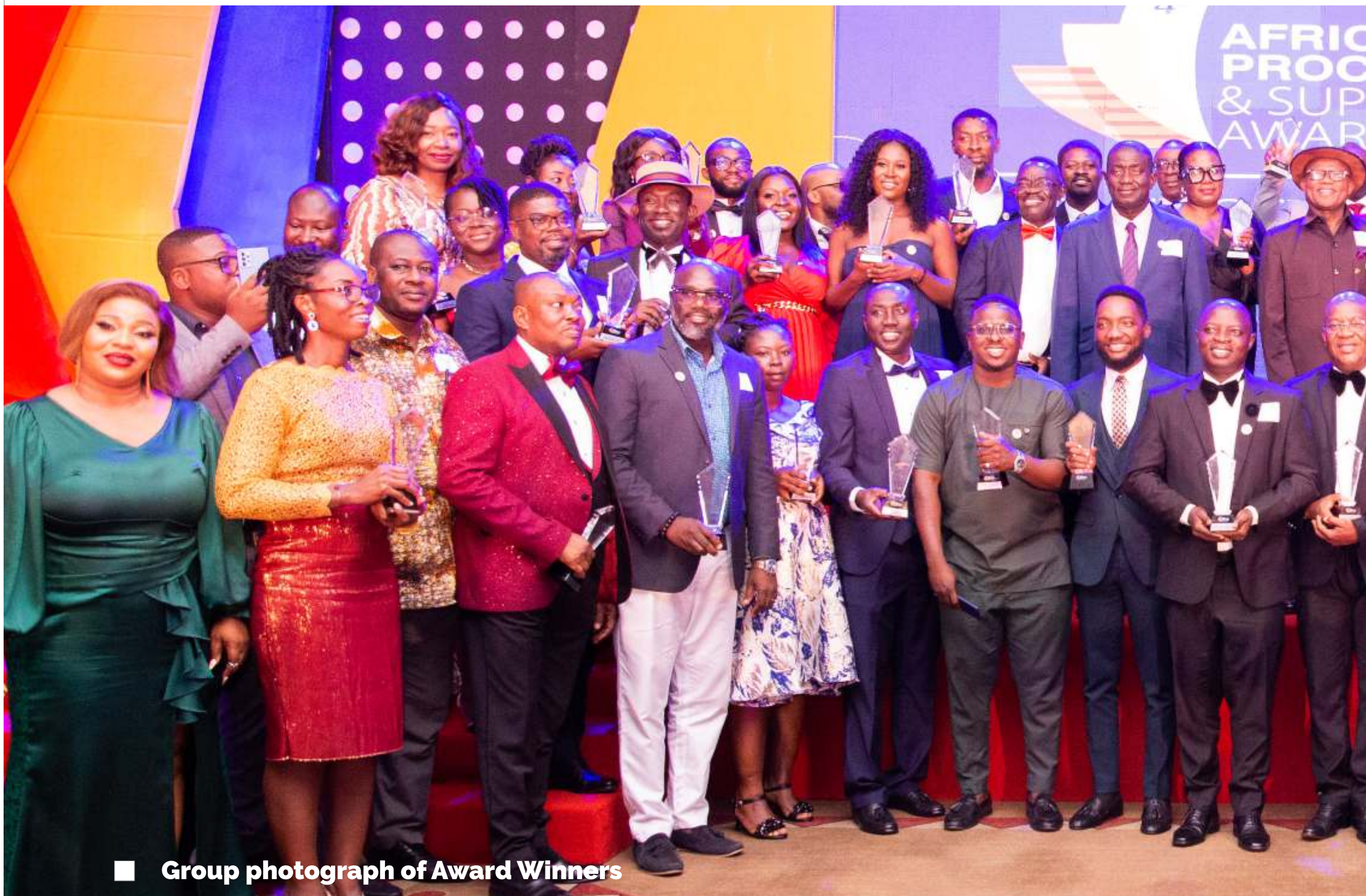
■ Group photograph of Award Winners

P rocurement and Supply Chain experts and organisation have been recognised at the 4th Africa Procurement and Supply Chain Awards on Friday, 24th June at Movenpick Ambassador Hotel in Accra.